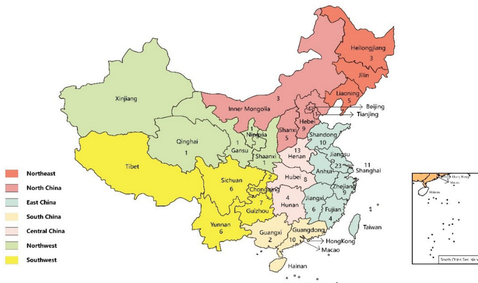
Figure 2 Geographic distribution of the 155 metabolic management centers in China involved in this study.

value 92.8% (95% CI: 92.4% to 93.1%), respectively. The interobserver variability (setting one grader as reference standard) between two primary expert graders had a sensitivity of 69.6% (95% CI: 68.4% to 70.8%) and a specificity of 86.8% (95% CI: 86.4% to 87.2%), with positive predictive value 53.1% (95% CI: 51.9% to 54.2%) and negative predictive value 93.0% (95% CI: 92.7% to 93.3%).