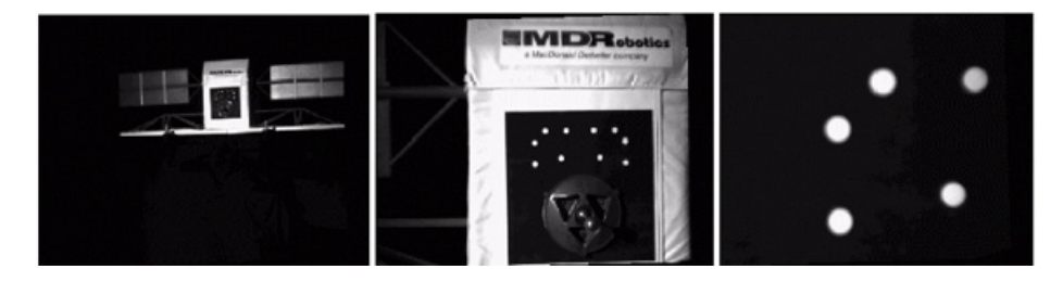
Fig. 3. Images from a sequence recorded during an experiment (first image at 5m; third at 0.2m)

ensure that the docking interface on the target satellite is visible from close range, so markers on the docking interface are used to determine the pose and attitude of the satellite efficiently and reliably at close range [12]. Here, visual features are detected by processing an image window centered around their predicted locations. These features are then matched against a model to estimate the pose of the satellite. The pose estimation algorithm requires at least 4 points to compute the pose. When more than four points are visible, sampling techniques choose the group of points that gives the best pose information. For the short range vision module, the accuracy is on the order of a fraction of a degree and 1mm right before docking.