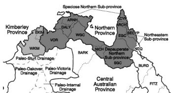
Figure 3. Map of Australia with shading representing provinces in the cluster

Application of exact frequent itemset mining using minsup = 5 produced a total of 31 itemsets and a reasonable result: the broadest cluster in terms of regions covered corresponds to one of data author’s results. Its 11 regions form a contiguous coastal band across Northern and Eastern Australia (shown as the dark-colored provinces in Figure3). However, application of AFI not only recovered the exact result (with fewer spurious blocks), but at \epsilon_c = \epsilon_r = 0.2 , it adds two more regions to the item-wise largest block. These regions have been acknowledged by Unmack as sensible additions: they are contiguous with the previously identified cluster in the northern portion of Australia, and appear to be the next most closely related regions in Unmack’s analysis. These regions appear in Figure 3 as the light gray regions.